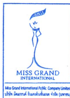
( Mr.Saksit Boonwanich )