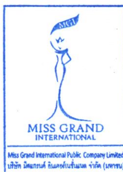
( Mr.Saksit Boonwanich )